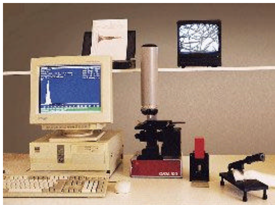
The OFDA package, showing PC, OFDA 100, monitor, slide spreader and snippet cutter.

In pursuit of the first of these objectives we have seen the number of OFDA machines dedicated extensively in the support of breeding programmes (as opposed to those used primarily in support of the textile manufacturing industry) in Europe increase from 0 in 1997 to 3 in 1999. The number of samples of fibre used for objective quality analysis has increased from an estimated 2000 (for all quality fibres in Europe) to 7000 in 1999. This has been a very positive start in co-ordinating national breeding efforts, and