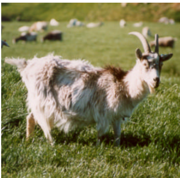
Scottish cashmere doe at MLURI

antagonistically related. Achieving this goal requires a multi-trait selection index approach.