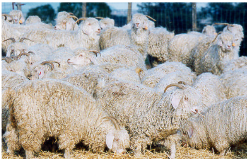
Portuguese mohair goats on the workshop field trip

The workshop report is published in full elsewhere, but it is worth examining here some of the conclusions that were drawn.