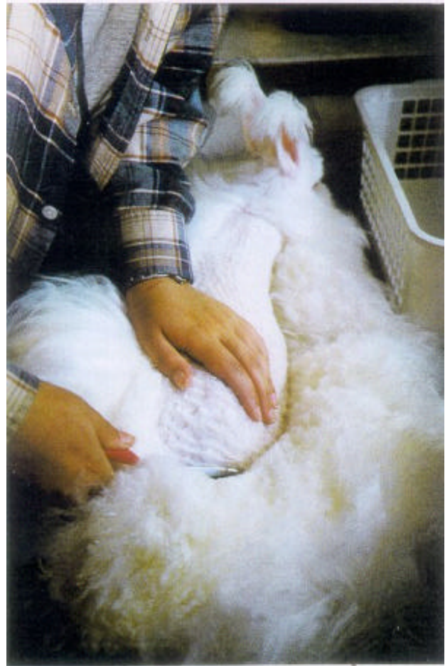
Figure 1 Shearing a Finnish angora rabbit